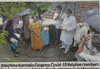
Dakshina Kannada Congress Covid-19 Helpline members distribute grocery kits to a family at Valencia in Mangaluru.